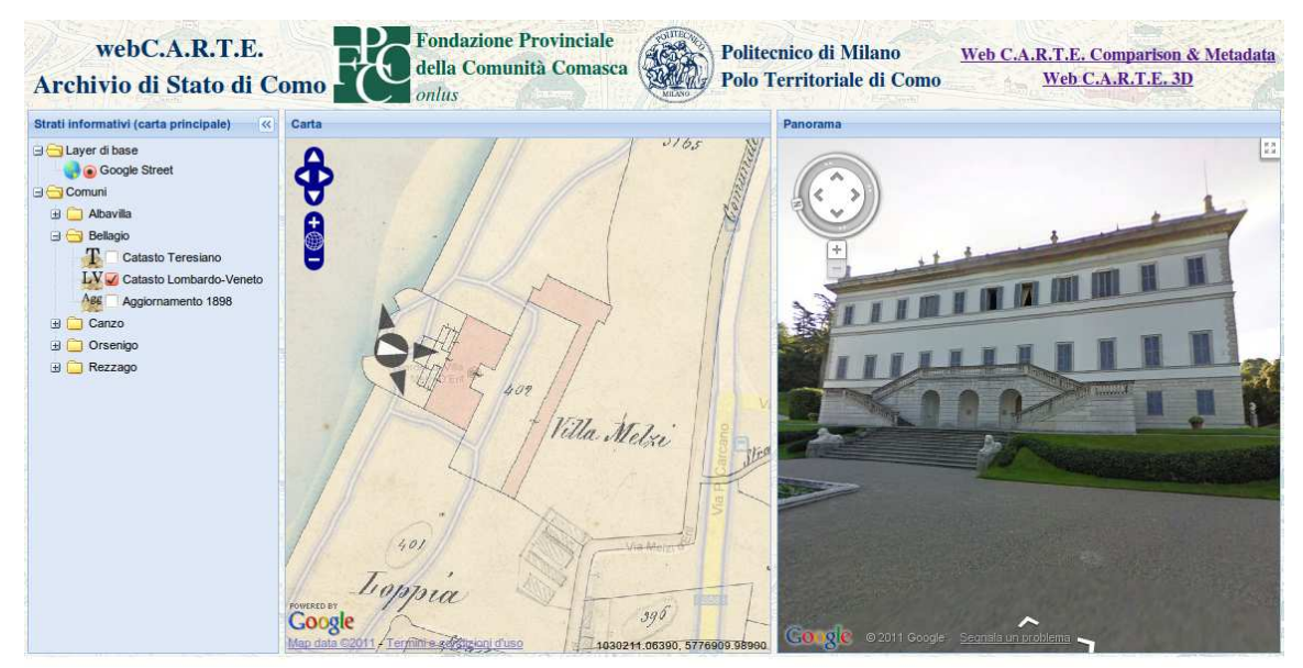
Figure 3. Example of integration between a Lombardo-Veneto cadastral map and the current Google Street View panorama