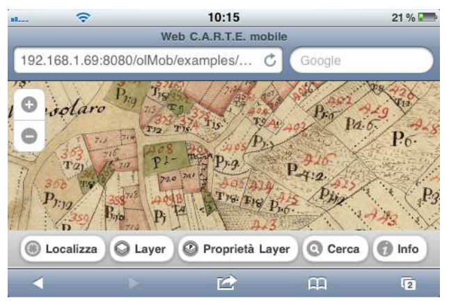
Figure 4. 2D visualization of a Theresian cadastral map in the web client for mobile devices

ISPRS Annals of the Photogrammetry, Remote Sensing and Spatial Information Sciences, Volume I-4, 2012 XXII ISPRS Congress, 25 August – 01 September 2012, Melbourne, Australia