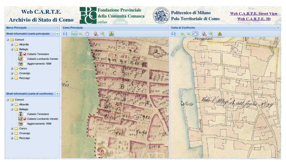
Figure 2. 2D visualization of Theresian (left) and Lombardo-Veneto (right) cadastral maps in the web client for computers

With the command Localizza (Locate), the estimated position of