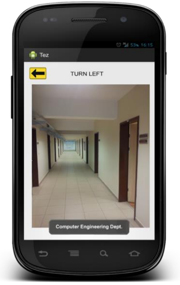
Figure 4. Mobile Application

the server in order. The application connects to the server by using http protocol. The script on the server will run and send the photo frames back to the smart phone. Thus, the indoor photos will be loaded to the smart phone in every three seconds, periodically. The period for loading the indoor photos to smart phone is defined as three seconds why a normal pedestrian would probably walk three meters in three seconds. Therefore, every point in the pedestrian's route will be displayed on the smart phone.