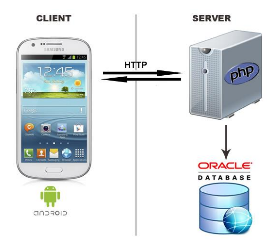
Figure 2. Architecture of the mobile application

on the database is coded in PHP (Hypertext Preprocessor) web based programming language. Oracle Database 11g Database is used on the web server as database management system to keep all information (nodes, links, the paths of photos, extra definition about points and so forth) about the mobile application. The results of query on the server is formatted as JSON (JavaScript Object Notation) to make a lightweight data transfer from the server to the smart phone www.json.org.