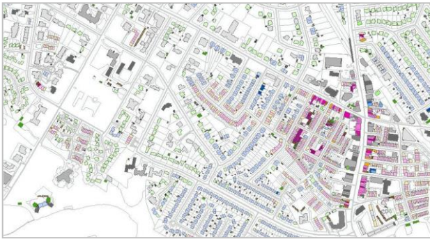
Figure 4. An example for Level 3 building classification