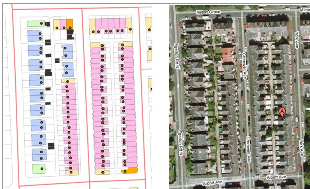
Figure 5. An example for filed verification