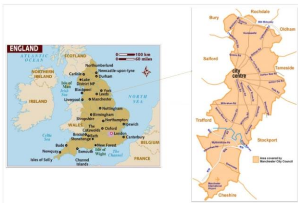
Figure 1. Study area – Manchester Metropolitan UK

Manchester metropolitan is selected as a test bench for this study. Manchester is situated in the northwest of England (geographical coordinates: 53° 30' 0" North, 2° 13' 0" West) and covers an area of around 116 km 2 , with a population density of 4,313 people per km 2 (ONS 2012) shown in Figure 1.