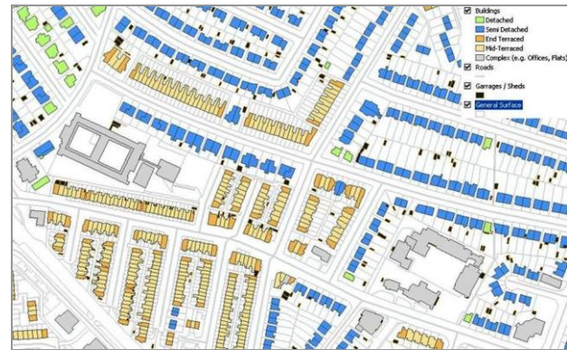
Figure 3. Level 1 Buildings classification map