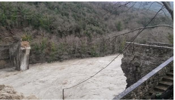
Figure 3: The remains of the bridge after destruction

currently under investigation in order to take the right measures to protect other similar stone bridges equally endangered.