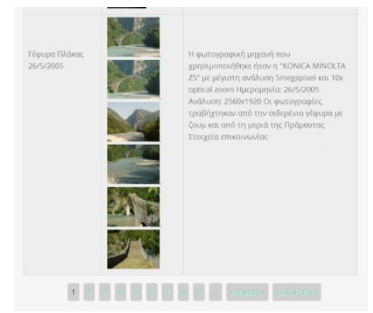
Figure 5: Image submission example.

Figure 4: Home page of the crowdsourcing webpage.