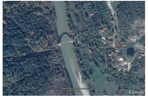
Figure 1: The Plaka Stone Bridge

constituted a wide trail network for communication and transportation in the whole Balkan area.