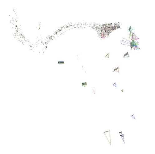
Figure 6: Viewpoint distribution.

The selected data have been processed using commercial as well as free software. VisualSfM is a free GUI application for 3D reconstruction that implements SfM and PMVS along with other tools (Wu, 2007; Wu et al., 2011; Wu, 2013; Furukawa and Ponce, 2010, Furukawa et al., 2010). In our case study, the dense point cloud was produced by 51 images (Figure 7).