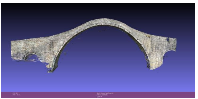
Figure 8: Dense point cloud produced in Agisoft PhotoScan – 56 images.

In order to improve the results, a masking procedure was applied on the images while processed in Agisoft PhotoScan. Therefore, background elements that are subjected to temporal changes and obstacles (people, trees, mountains, sky etc.) have been excluded during photo alignment. This results to less noisy dense point clouds (Figure 8). A mesh has also been created out of this dense point cloud, followed by the texturing procedure (Figure 9).