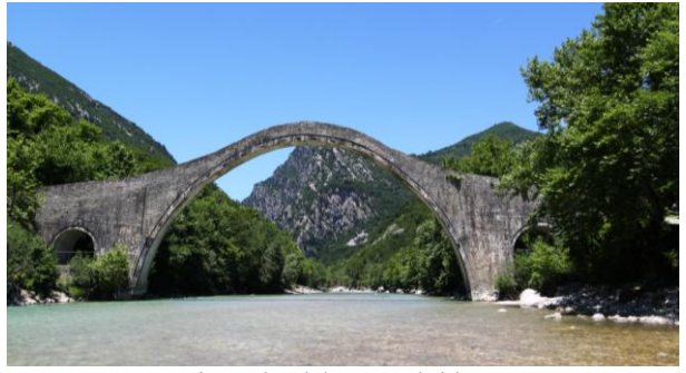
Figure 2: Plaka stone bridge.

The stone bridge of Plaka over river Arachthos (Figure 1) was a representative example of the aforementioned monuments. It was built in 1866 by local Greek stonemasons in order to facilitate transportation and trade needs (http://www.petrinagefiria.uoi.gr/). It was the widest stone bridge in the area of Epirus with 40 meter span and the biggest single-arch bridge in the Balkans with a height of 20 meters (Figure 2). Next to the main arch, there were two smaller ones 6 meters wide, the so-called relief arches.