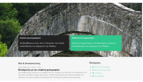
Figure 4: Home page of the crowdsourcing webpage.

Να "βάλουμε πλάτη" να σηκώσουμε ξανά το Τεφύρι της Πλάκας!