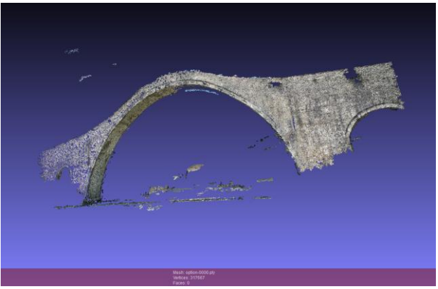
Figure 7: Dense point cloud after PMVS software (VisualSfM) - 51 images.

The selected data have been processed using commercial as well as free software. VisualSfM is a free GUI application for 3D reconstruction that implements SfM and PMVS along with other tools (Wu, 2007; Wu et al., 2011; Wu, 2013; Furukawa and Ponce, 2010, Furukawa et al., 2010). In our case study, the dense point cloud was produced by 51 images (Figure 7).