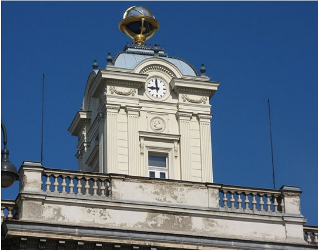
Figure 7. The tower-pavilion of the first Pan-Austrian Military Geographical Institute in Vienna (1842). A round relief portrait below of the clock reminds on Johannes Kepler (1571-1630), the elected patron of the building