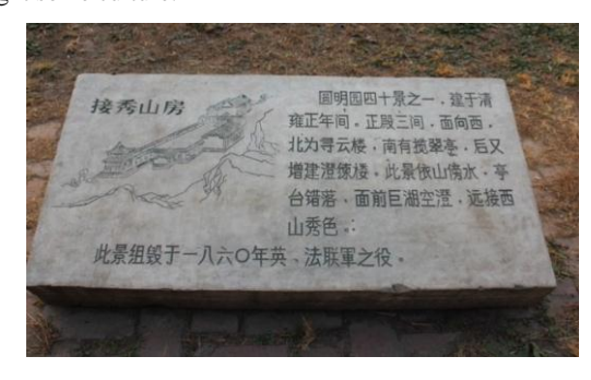
Figure 2. Boring commentary facilities

The Jie xiu shan fang area, the site is in the open state of conservation, most of the building components stacked disorganized, difficult to understand site visitors from the status quo, the only one of the explanatory signs are more simple, just describe the access time and the surrounding housing construction Jie xiu shan fang environment, not including construction background, function and other aspects, can not effectively explain to visitors take Jie xiu shan fang resort brought some culture.