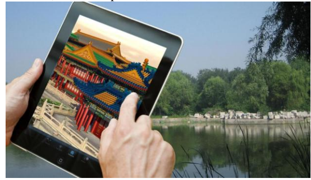
Figure 7. digital exhibition with Ipad

At the same time, with the development of the intelligence industry, we can reconstruct the landscape of garden of gardens through digital technology, all the tourist also can get their insignt to royal gardens and buildings of Qing dynasty and comprehend the subtlety of Yuanming by using mobile terminals, such as ceilphones, IPAD, etc.