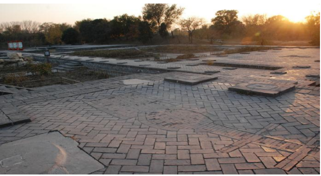
Figure 6. ruins of Han jing tang,

beacuse of its large scale and massive sites Old Summer Palace is very hard to be rebulided. Meanwhile rebuilding may disturb the site protecting even do damage to the site. Tourist can get overall knowledge of the building contour and layout through sign exhibition. Such as ruins of Han jing tang, the use of brick ruins of the original package, in order to show the building's original base address. Gray tiles assembled, during which representatives of brick red "lian di kang" and column bases.