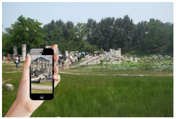
Figure 8. digital exhibition with ceilphone