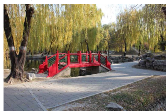
Figure 3. Architectures and structures which affect palace landscape

roads is also directly affect the overall style and features of the zoo, destroyed the old Summer Palace style of the original true. Most of the park without a design that is building bridges and culverts, the presence of bright colors, scale inappropriate material too modern and bridge superior site location is not a problem. Yuanmingyuan bridge is not only a means of transport within the park's landscape is also to convey the historical information, should be treated with caution.