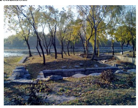
Figure 1. the Old Summer Palace site which is lack of esthetics

Such as Jianyuan site, locates in the southeast of changchun park scenic area, east is close to the walls, wading in the western conference. There is no archaeological work carried out as a park site, nor any protective measures, sites in outdoor conditions, most of the soaking in the water. Sites are scattered in construction, the surrounding overgrown and poor overall site condition.