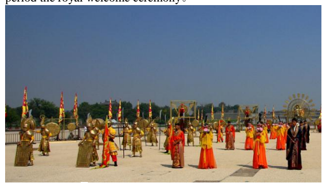
Figure 8. live performance - "dan feng ying bin"

approach greatly improves the ruins of ornamental and interesting, make dull historical records and research become vivid images. As xi 'an Da ming palace, in okimichi square arrangement subject-live performance – "dan feng ying bin", through creative artistry, a repeat of the highest level of tang period the royal welcome ceremony _{\circ}