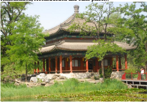
Figure 4. rehabilitation of "Jian bi" Pavilion

Rehabilitation mode refers to the recovery of the construction site, a visual representation of the site to visitors by entities presenting ways. Considering the ruins of their own values, conservation status and other factors to determine the construction program, such as site rehabilitation, across empty rehabilitation, reconstruction and other places.