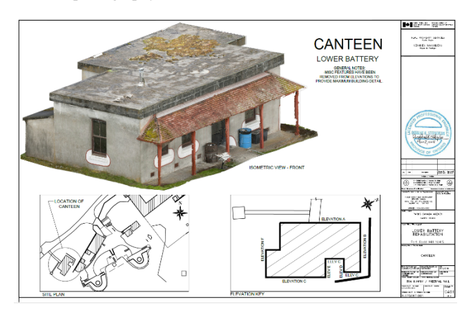
Figure 2: Cover sheet and Isometric image of the Canteen building at Fort Rodd Hill.

shows the rectified elevation from 2010). The elevations shown in figure 3 are more complete than efficiently possible through rectified photography.