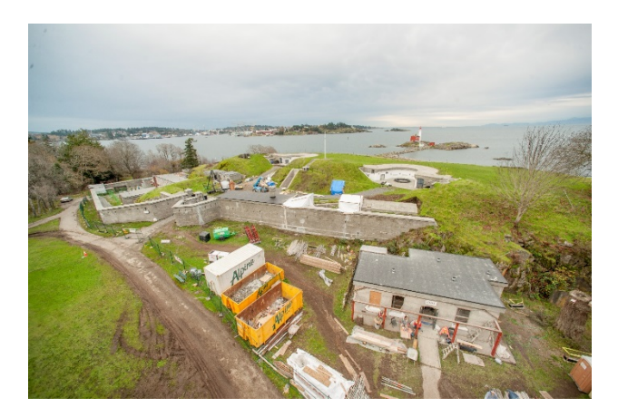
Figure 1: Aerial view of Fort Rodd Hill National Historic Site of Canada Lower Battery rehabilitation.

supplemented with record photographs to help communicate the repair methodology or site specific conditions.