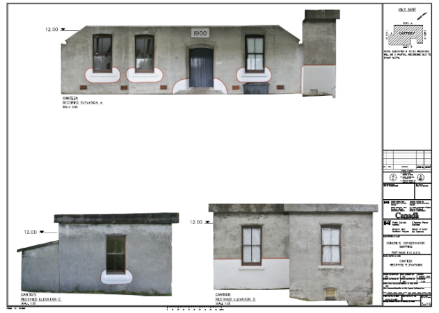
Figure 4: Example of ortho-rectified elevations.

Because the rear elevation of the Canteen building has only a 1m gap between a cliff face and the wall, not allowing for sufficient backup to capture the head on photos typically required for rectification. The documentation time on site required for photogrammetry is typically much less than that needed for rectification, which typically requires four measured control points to rectify each photo. Once the model has been generated, each ortho-photo is quickly created and laid out in