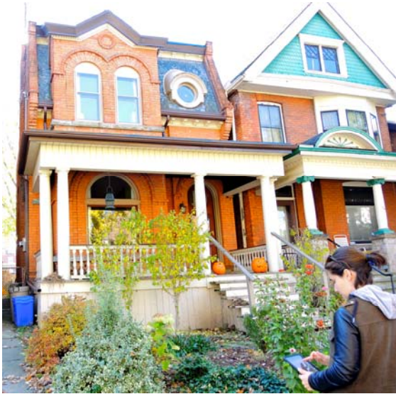
Figure 3. Surveyor using tablet survey app in the field

In the design of the digital database tool, we also included a feedback/quality control feature that allowed the reviewer to either flag the property for further review, indicate assumptions made, or provide comments for other team members. As the input was live, this permitted instantaneous review for the team members not in the field.