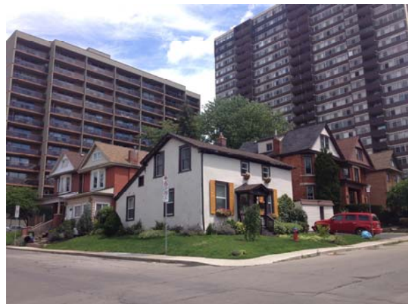
Figure 4. Varied building styles, scales and eras in Durand

The inclusion of a sub-area scale of study permitted the documentation of heritage values that were best described beyond the scale of individual property lines and within the scale of the larger neighbourhood. These values manifested themselves as streetscapes, composition of urban form and visual relationships. Presenting Durand as an area composed of distinct sub-areas also appeared to enrich community dialogue during engagement activities.