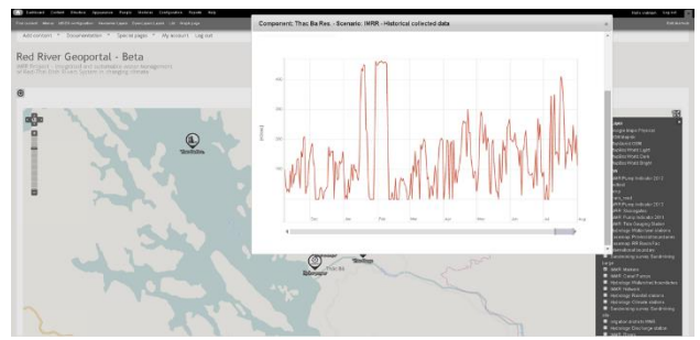
Figure 4. Red-Thai Binh rivers geoportal user interface

The geoportal is characterized by its efficient and non-technical approach to the access, operation, and distribution of the project's geospatial data. Currently, the simulations in the geoportal are being tested and improved.