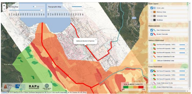
Figure 2. Buried Rivers user interface

The architecture described represents only one possible combination of FOSS for the creation of Web applications. Different components might be adopted according to the developer's needs and level of expertise. Nevertheless, the architecture includes all the basic components to implement an FOSS-based geospatial Web application compliant with OGC standards.