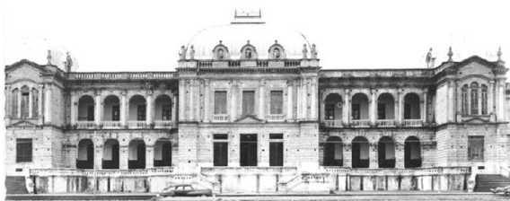
Figure 3. Executed Project. Changes considerably the architectural language in the second floor.

On 2018, in order to guarantee a good quality in the educative infrastructure and the satisfaction of needs of current occupiers, the Ministry of Education of Ecuador, through its sectional district of Azuay, asked the University of Cuenca, to develop the Restoration studies for the BMH. For the academic actor, it became a great opportunity to develop a proposal nourished by data of secondary sources, but especially for innovating technical diagnosis, designing a participatory process to reach what has been called a participatory diagnosis or a "collective auto-diagnosis". This, would imply the knowledge construction based on the exchange of diverse types of knowledge, on this occasion scientific and empirical.