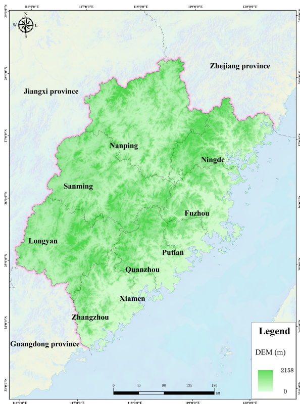
Figure1. The administrative map of Fujian province

Fujian province is located on the southeast coast of China, with latitude 23°30'N-28°30'N and longitude 116°E-120°30'E. Fujian province has jurisdiction over 9 prefecture-level cities, and the total area is 12.14 million hectares, as shown in Figure1. It faces the mountains and the sea. The landforms are mainly mountainous and hilly, accounting for more than 80% of the total area of the province. The regional differences in ecological environment are obvious, and landscape is fragment and complex (Zeng, 2003), forming a feature of abundant and widely distributed vegetation in the territory. Fujian province is located in a subtropical monsoon climate zone, with a warm climate, abundant rainfall, and dense river networks.