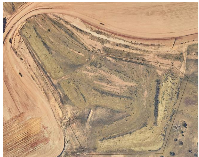
Figure 3: Aerial image of Site 2, a cluster of topsoil stockpiles at WRP Mine site.

Site 2 consists of a cluster of topsoil stockpiles that were cleared of vegetation along the top surface as highlighted in the Figure 3. The area was chosen as a typical scenario onsite as it was common practice for stockpiles to be placed in proximity. There are issues with this type of formation depending on the size and shape of stockpiles, in terms of laser scanning activities access and line of sight for the lasers can be difficult especially in the gullies between piles. To accurately scan these stockpiles multiple scanning stations is necessary, scan can be affected by the height of stockpiles and driveable access, leaving opportunities for gaps to exist within scans. These stockpiles cannot usually be scanned in a grid formation and scanning stations are dependent on the topography. Site 2 was surveyed on the 3rd of March 2020.