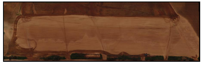
Figure 2: Aerial image of Site 1, the base of a subsoil stockpile at WRP Mine site.

Two sites were selected for this study. Site 1 was chosen due to the flat consistent surface and offers little variation that could affect the outcome. The stockpile had recently been distributed over this site and the base was levelled to the subsoil design surface, with some modifications to suit the natural surface adjacent. The grid is measured roughly via the vehicle's odometer at 100m spacings, the spacing is also adjusted to suit the topography as elevated ground is preferred for scanning stations. Area 1 was surveyed on the 16th of April 2020.