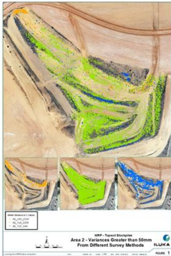
Figure 5: Map of Area 2 indicating the +/- 0.05m variations between the TLS, UAV and Combined Surface Models.

mounted laser scanning limits the station options available. The gullies between stockpiles show up as holes in the data and this is one of the reasons a secondary survey with UAV is conducted. The blue points indicate the difference between UAV and TLS collection, it is easy to see where the laser scans have missed data due to the scan positions and the topography. When the TLS and UAV point clouds are combined to create a new surface model, there is a reduction in the number of points outside the 50mm tolerance.