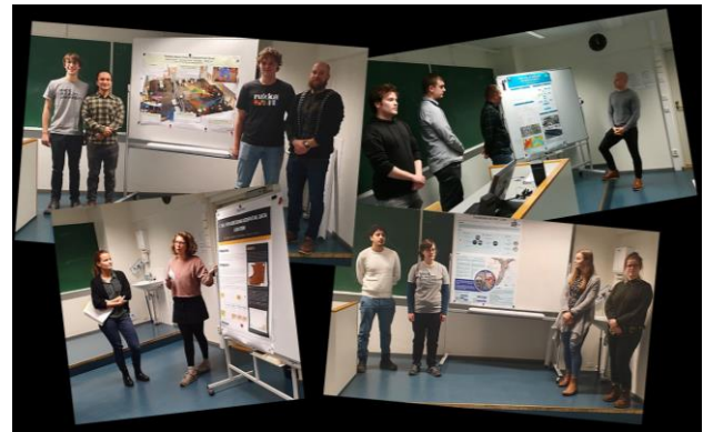
Figure 3. Examples of posters in a final seminar.

and peer-feedback session, i.e. all groups (presenting group included) are asked to evaluate current presentation and the poster within their groups. After the groups are ready, each group, starting with the presenting group, shares their thoughts on the pros and cons of the outcomes and the presentation. The process is repeated with each group. At the end of the final seminar we ask all the students to individually evaluate the whole course.