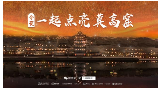
Figure 3. Light Up the Mogao Grottoes.

historical value, cultural value, social value, technological value and artistic value of cultural resources, but also relieve the shortage of culture and entertainment experienced by those staying at home, distribute the pressure of tourist reception of cultural heritage sites, and effectively reduce the adverse effects of "explosive" post-pandemic tourism on cultural heritage sites.